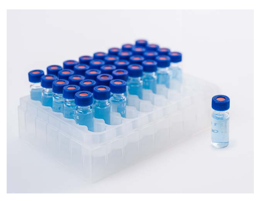
Handle samples and containers correctly, particularly those susceptible to electrostatic charging (see section 8.).

Always use clean tweezers and clean tare containers. Do not touch anything with your bare hands as this can transfer sweat, oils and dirt. Even when wearing gloves, you should avoid touching samples and tare containers as the transfer of heat or statics may result in an increase in stabilization time and/or influence the weight result.