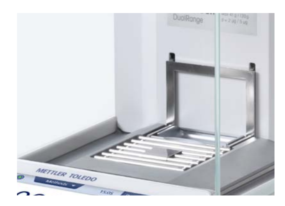
Take care that the hanging weighing pan is mounted correctly.

The XPR106DUH has a special drip tray with a slightly lower section. The hanging weighing pan fits precisely into this section. This design prevents movement of air around the weighing pan and helps to maintain thermal stability. Due to the close fit of the two components, you must take care, when assembling them after cleaning for example, that they are correctly centered and are not touching each other. In addition, ensure that there is no dust, dirt, hair or other object mechanically bridging the weighing pan to the drip tray. This would result in incorrect results and may cause drifting. A smooth brush can be used to remove any dust or other object.